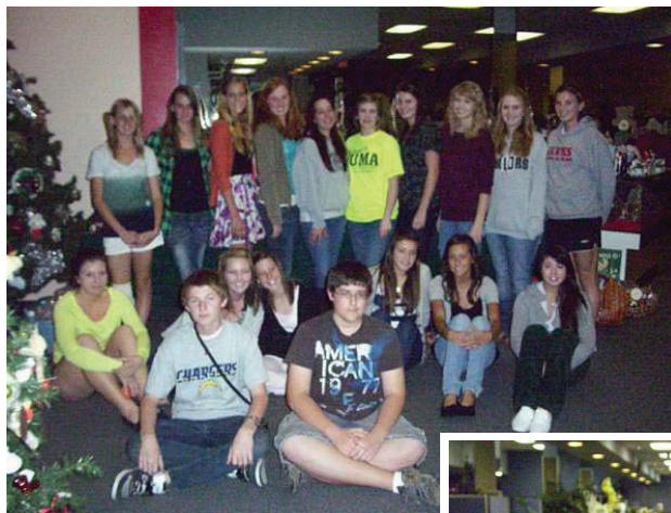
Assisteens meeting November 9